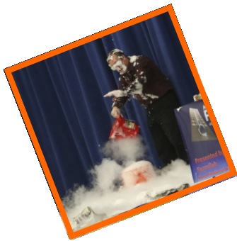
"MR. FREEZE" CRYOGENICS SHOW @ 6:30

Saturday, October 22nd 6:00 pm - 9:00 pm