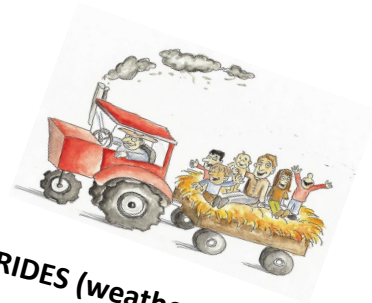
HAYRIDES (weather permitting)